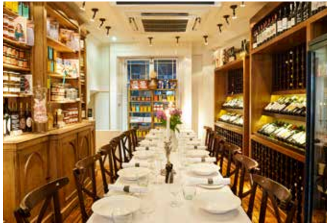
FIRST FLOOR AND PASTIFICIO